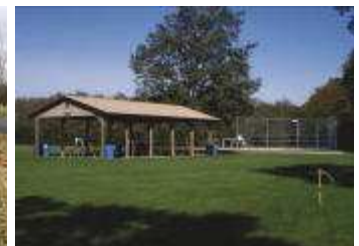
Oak Ridge Park