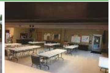
Town Hall Meeting Room