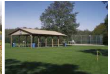
Oak Ridge Park