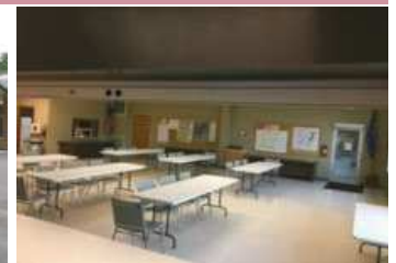
Town Hall Meeting Room